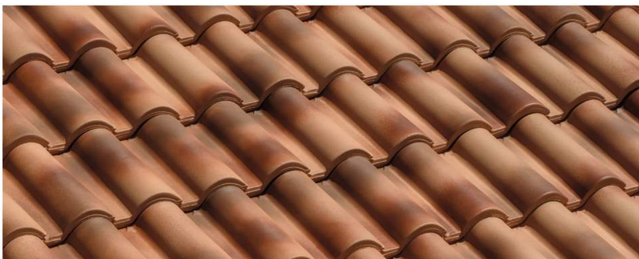
Portoghese castelli romani