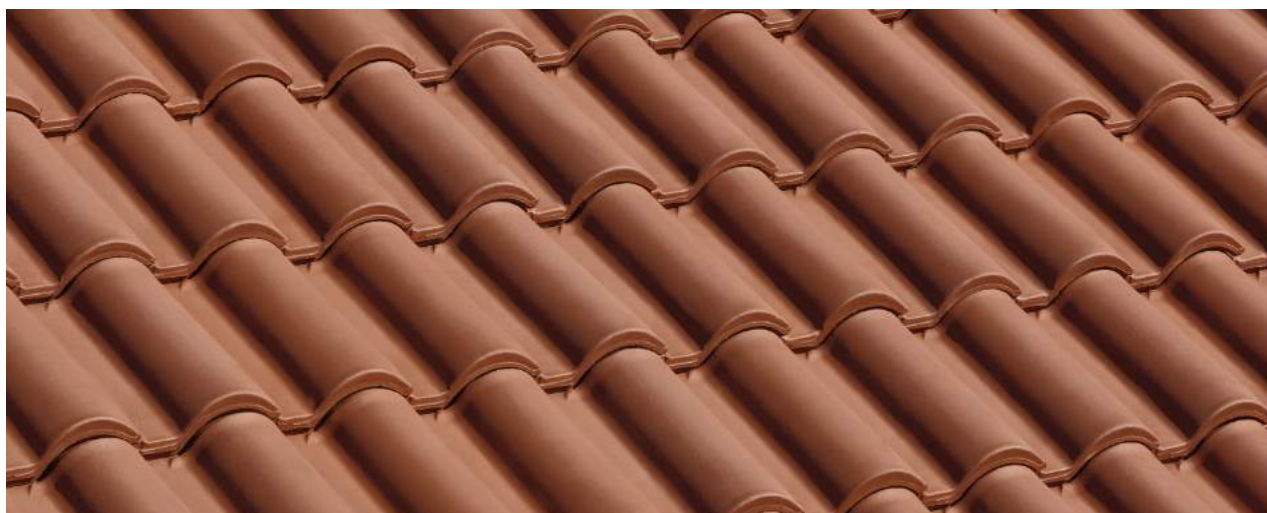
Portoghese natural red