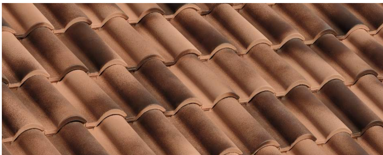
Portoghese antica monferrato