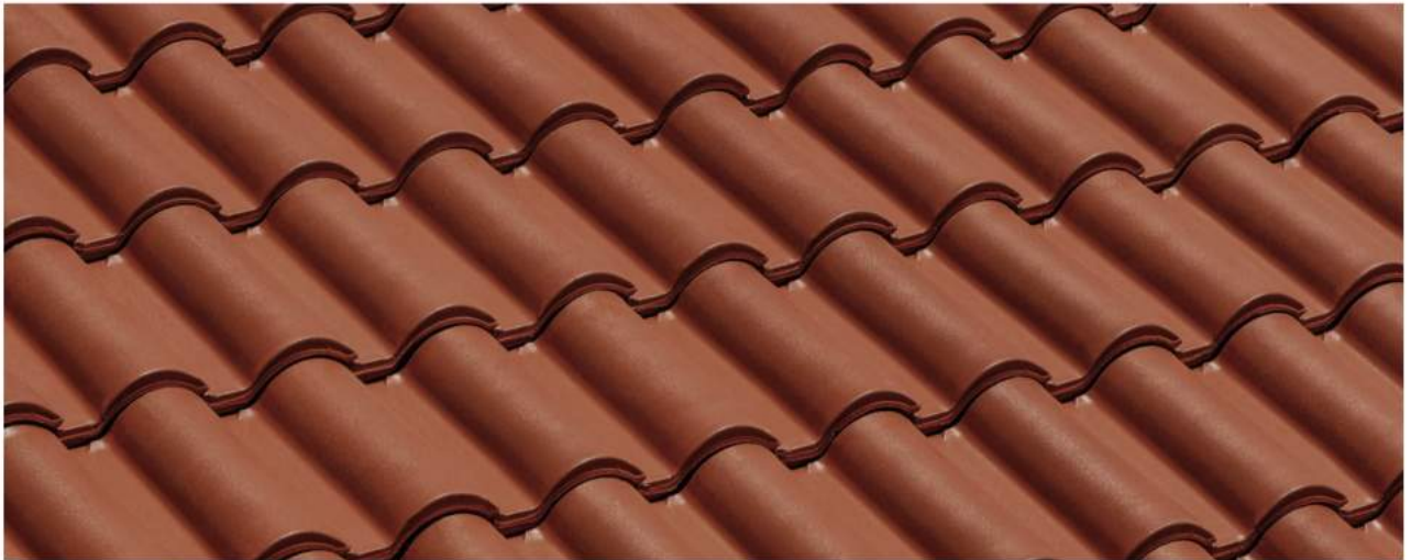
Portoghese dark red rubin