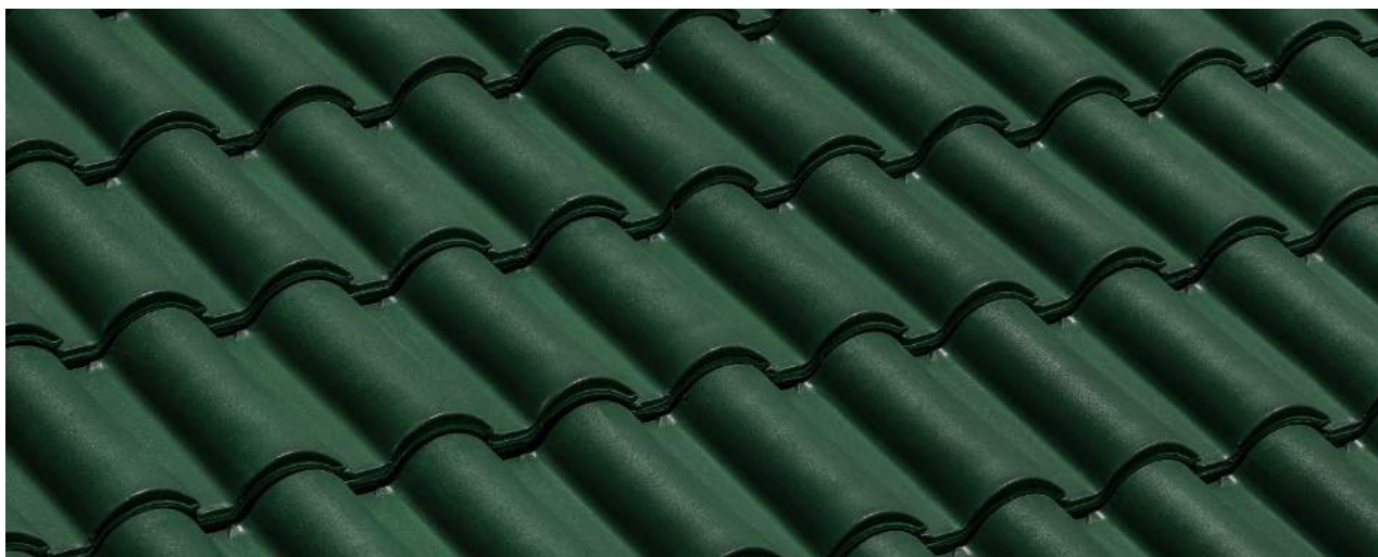
Portoghese bright green