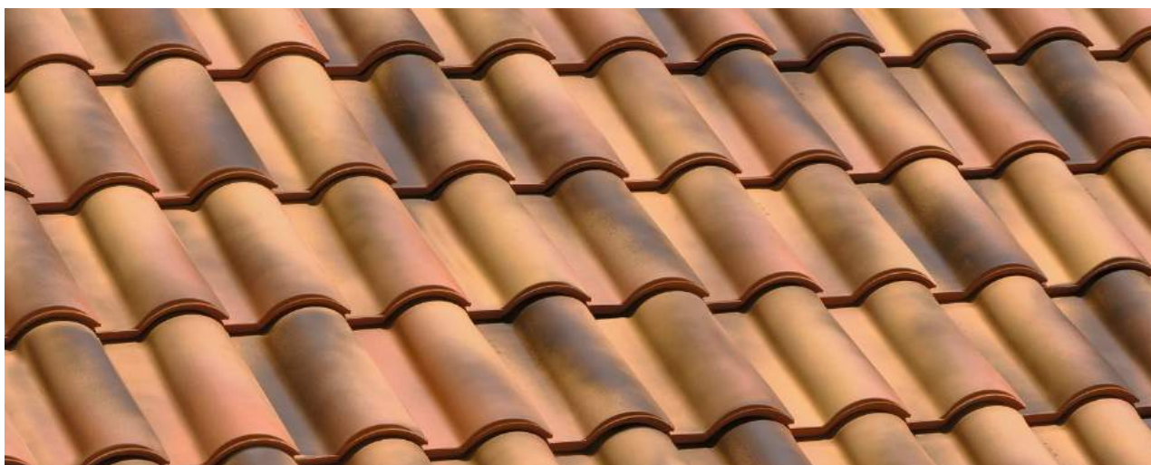
Portoghese corte a sera