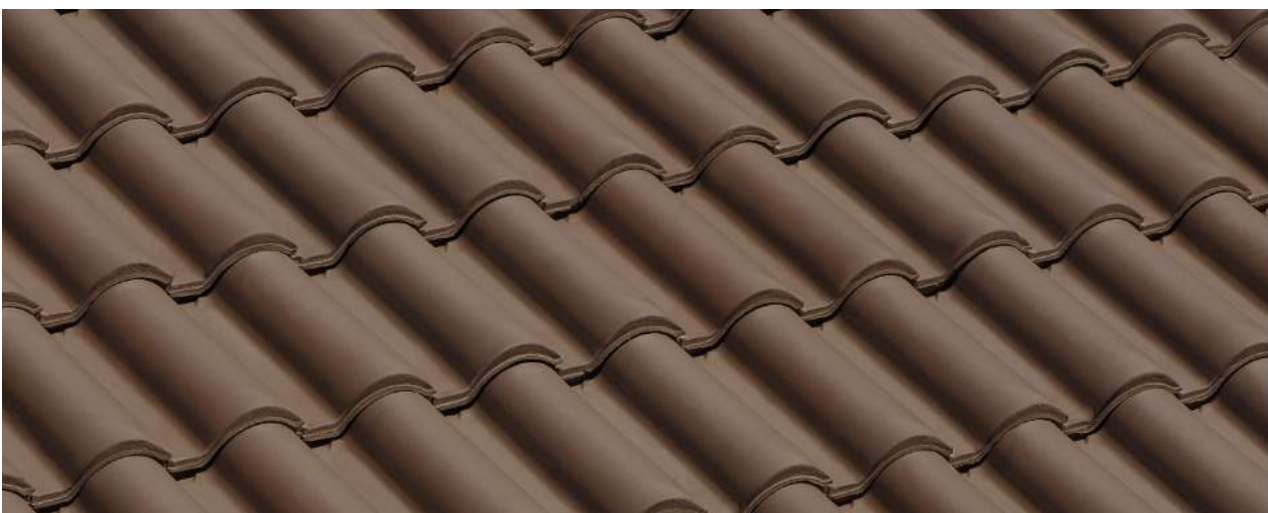
Portoghese dark brown