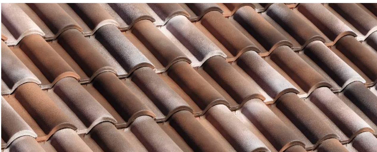
Portoghese antica cassino